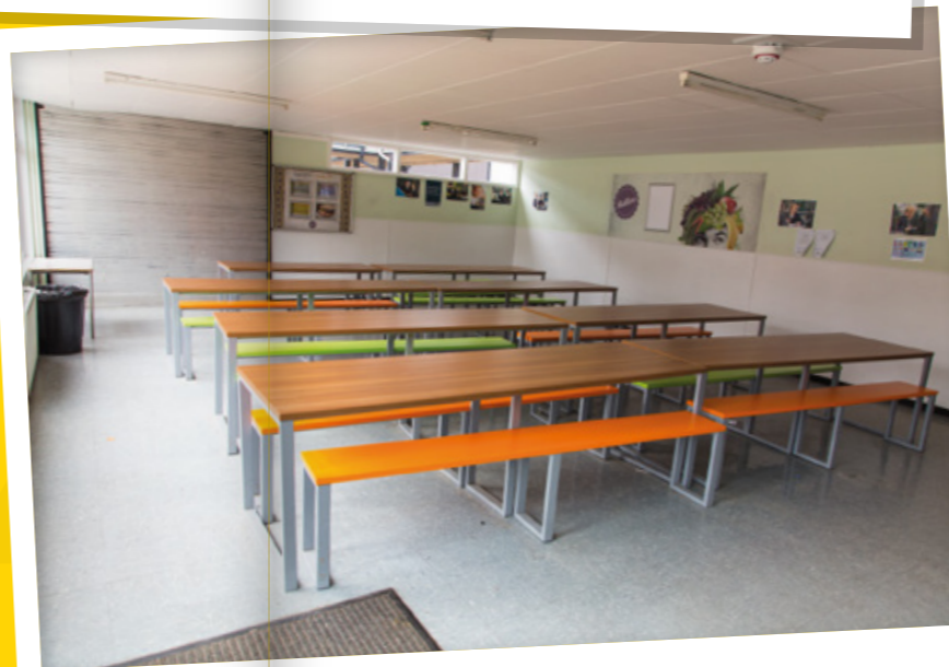
HATFIELD DINING ROOM