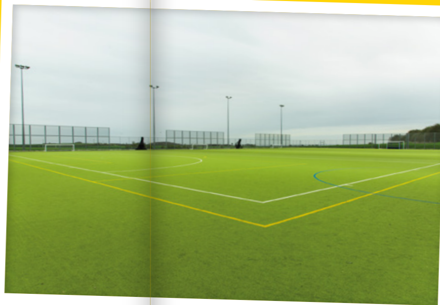
2G ASTRO-TURF PITCH